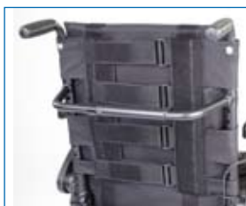
Tension adjustable backrest