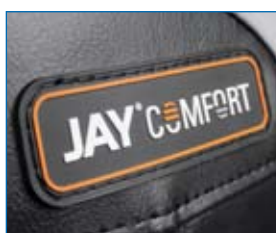
Available with full range of JAY Comfort backrests and cushions