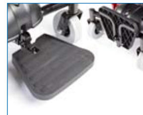
Central flip-up footrest