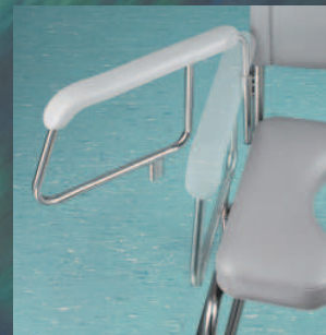
Swing away armrests

Easy side transfer allowing the user to move onto the shower chair without the need for manual handling.