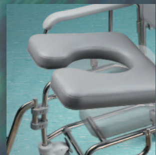
HF welded seat

Available in 18", 19" (for Clos-o-Mat only) and 21" model options the TransAqua is designed to suit both user requirements and site conditions. A variety of internal widths can be achieved without the need to select a custom chair.