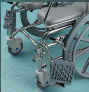
Swing away footrests

Moulds to body shape for increased user comfort.