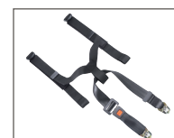
Seat belt system including hip belt**