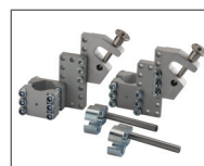
Brackets for the wheelchair