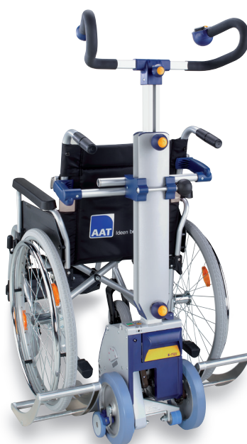
Universal rack SDM7

For a person who merely needs help climbing stairs the s-max sella is the optimum solution. The chair is particularly narrow and thus suitable for very narrow stairways and even winding stairs.