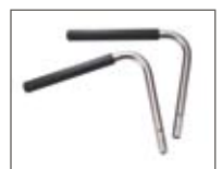
Widening of the arm rests