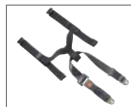
Seat belt system including hip belt