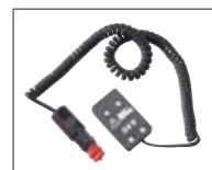
Charger for your car