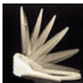
Hydraulic Seat & Lid

EASILY REPLACES MOST STANDARD TOILET SEATS