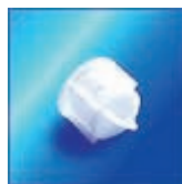
Built in Filter